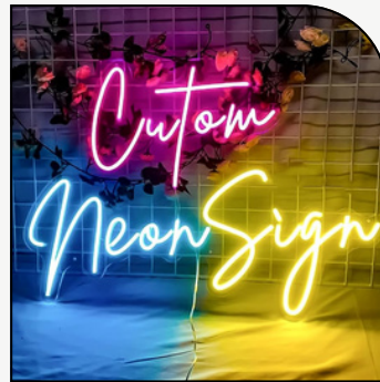
Table Top: 5.5x8.5" - $35 8.5x11" - $45